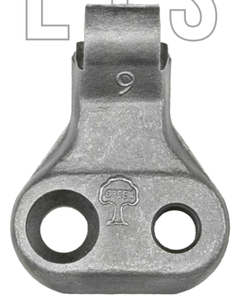
900 Series ® Previous Version

The part number of the pocket will be displayed above the Green Manufacturing tree logo, while previous versions will only have the first number of the corresponding series. The LoPro ® pockets will always have one counterbore hole on the left and one threaded on the right. These pockets are reversible reducing the number of different parts in the system.