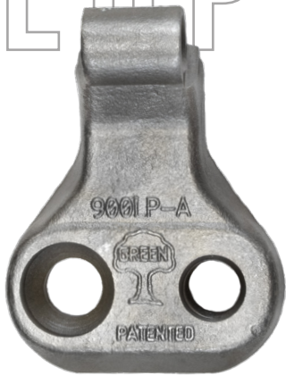
900 Series ® Current Version

The part number of the pocket will be displayed above the Green Manufacturing tree logo, while previous versions will only have the first number of the corresponding series. The LoPro ® pockets will always have one counterbore hole on the left and one threaded on the right. These pockets are reversible reducing the number of different parts in the system.