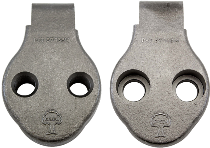
1100 Series™ Threaded pocket